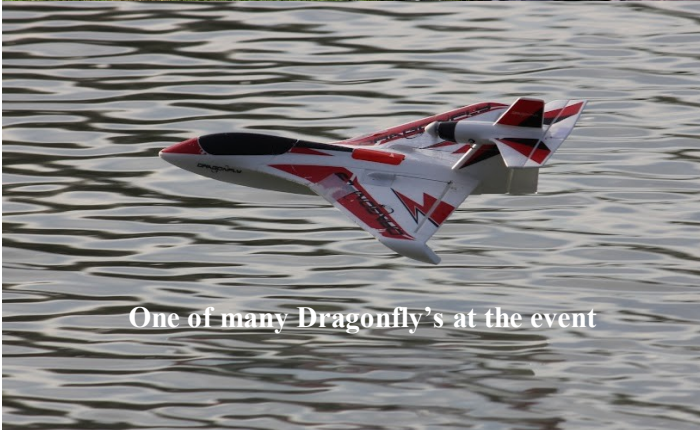
One of many Dragonfly's at the event