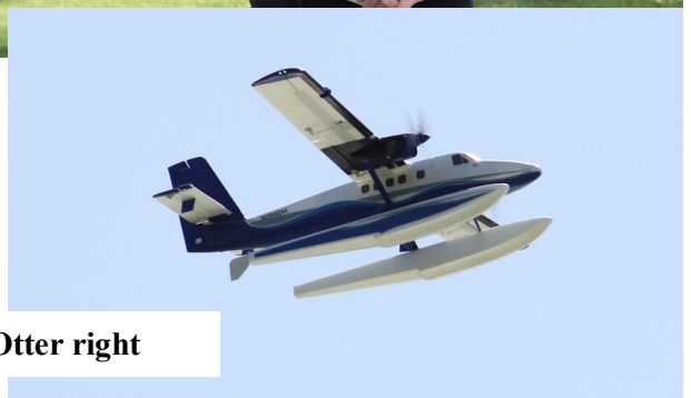
Albatross left, twin Otter right