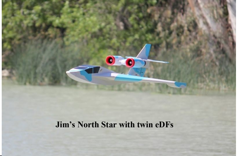
Jim's North Star with twin eDFs