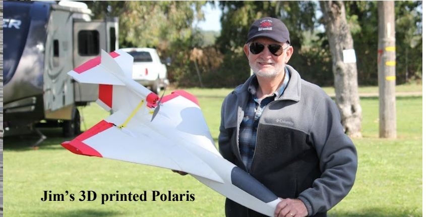
Jim's 3D printed Polaris